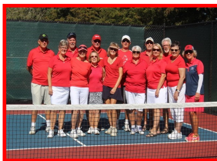
Maple Leaf Pickleball Club

The MLPC Club from Maple Leaf Golf and Country Club in Port Charlotte boasts a membership of almost 200. The Club has outgrown the 2 courts built 3 years ago and is now in the process of designing and fundraising for 4 more courts. MLPC also has both open and structured play, including men's, ladies' and mixed ladders, instruction, and social tournaments.